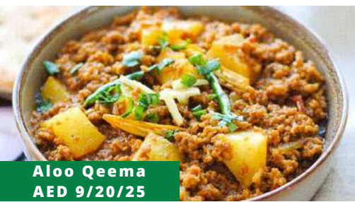
Aloo Qeema AED 9/20/25