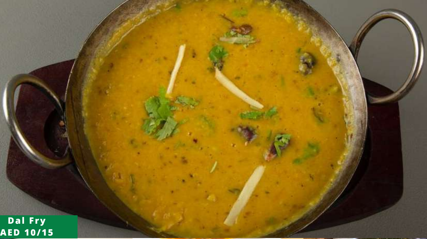
Dal Fry AED 10/15