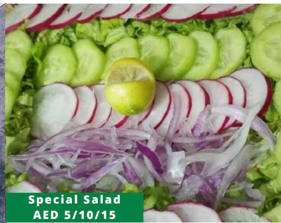
Special Salad AED 5/10/15