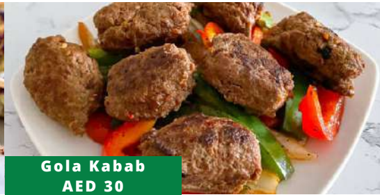
Gola Kabab AED 30