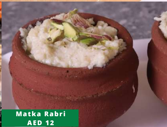
Matka Rabri AED 12