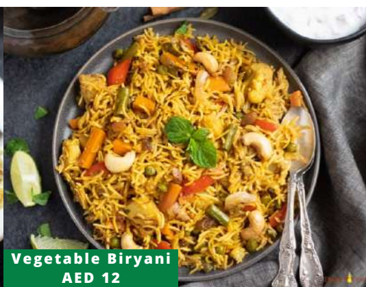
Vegetable Biryani AED 12