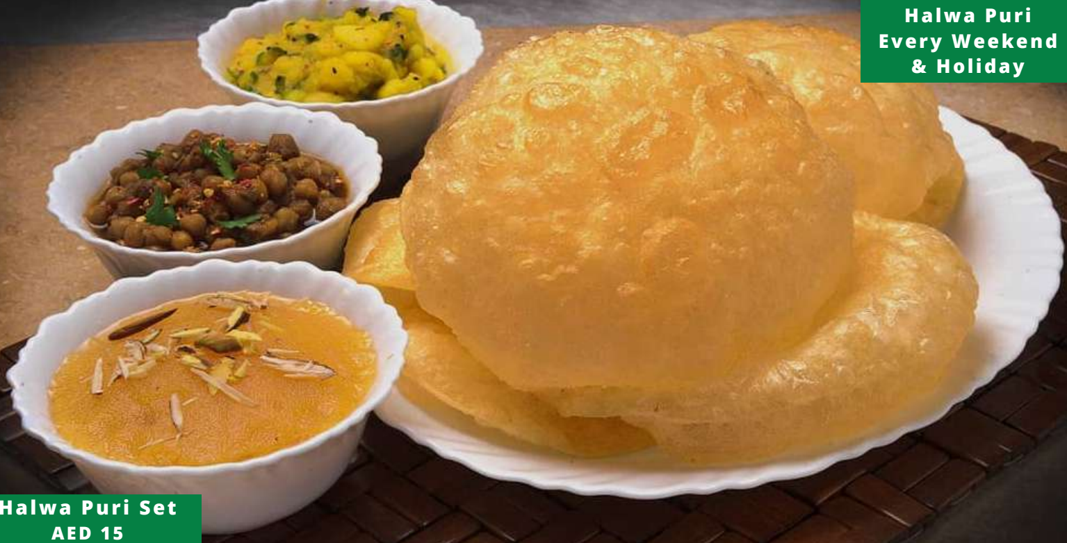
Halwa Puri Set AED 15