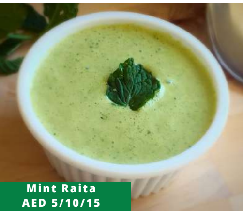
Mint Raita AED 5/10/15