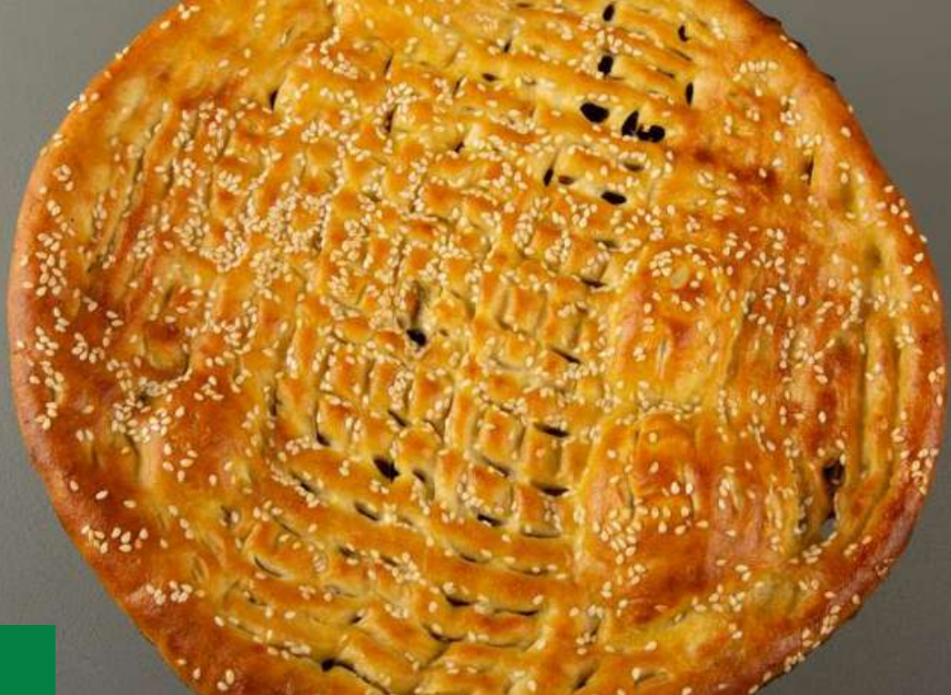
Rogni Naan AED 3