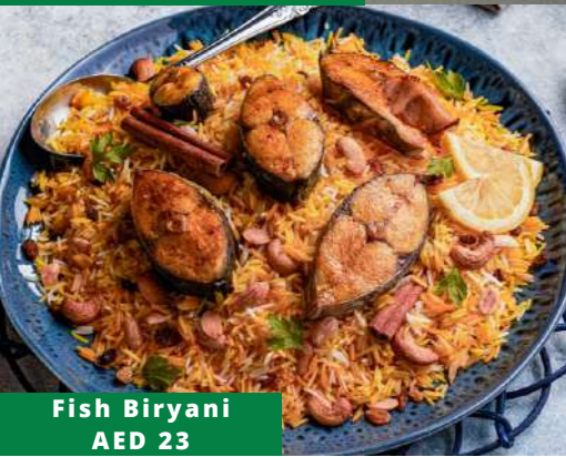
Fish Biryani AED 23