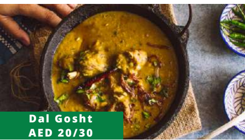
Dal Gosht AED 20/30