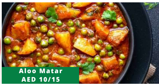
Aloo Matar AED 10/15