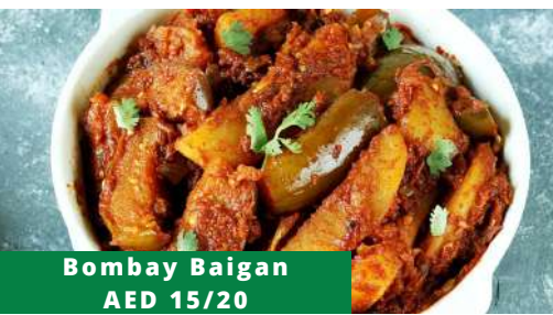
Bombay Baigan AED 15/20