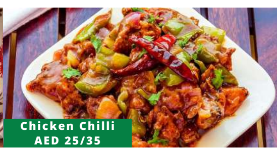
Chicken Chilli AED 25/35