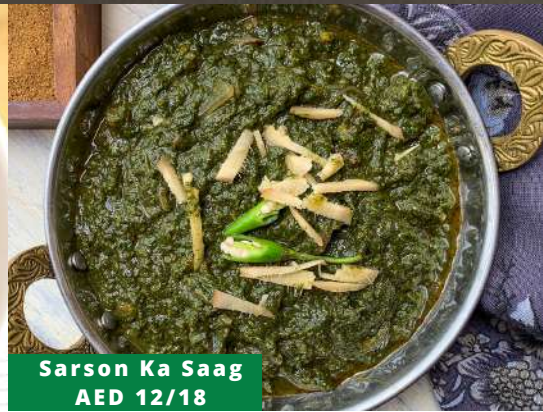
Sarson Ka Saag AED 12/18