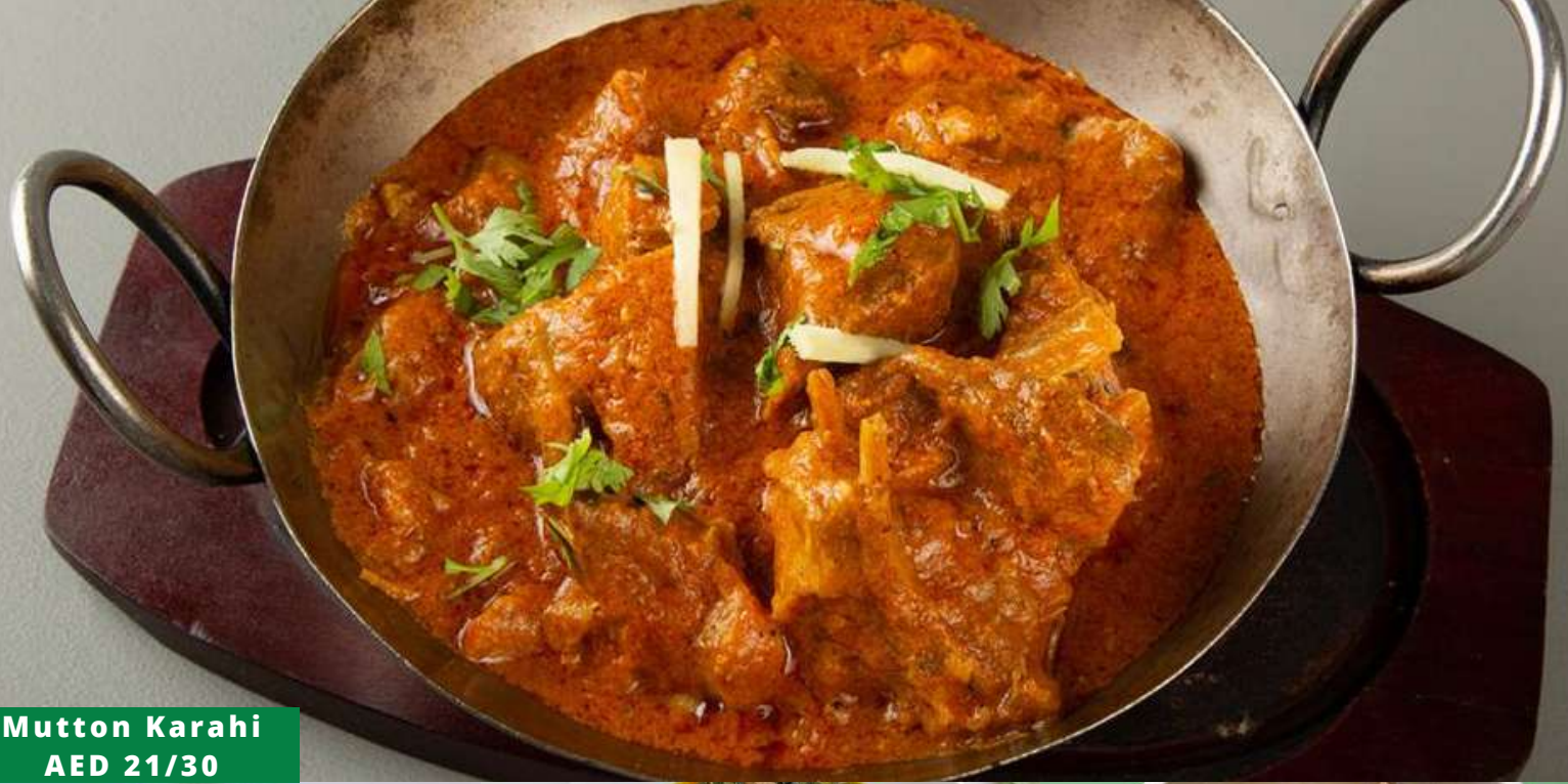
Mutton Karahi AED 21/30