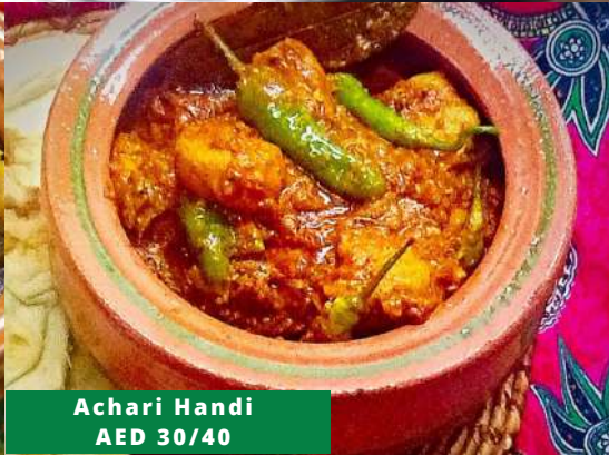
Achari Handi AED 30/40