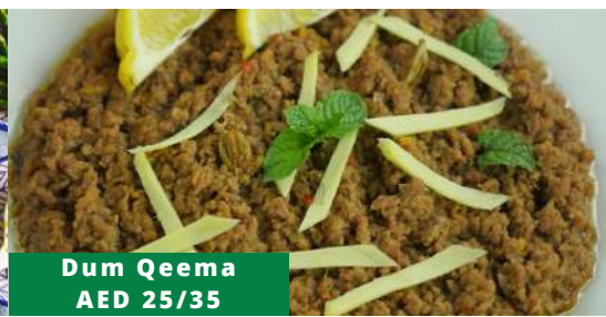
Dum Qeema AED 25/35