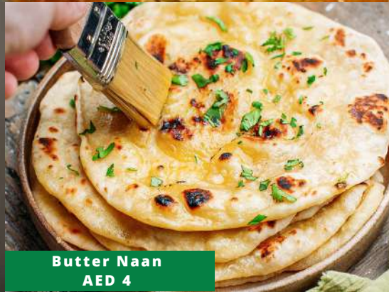
Butter Naan AED 4