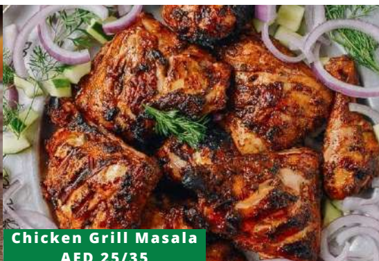
Chicken Grill Masala AED 25/35