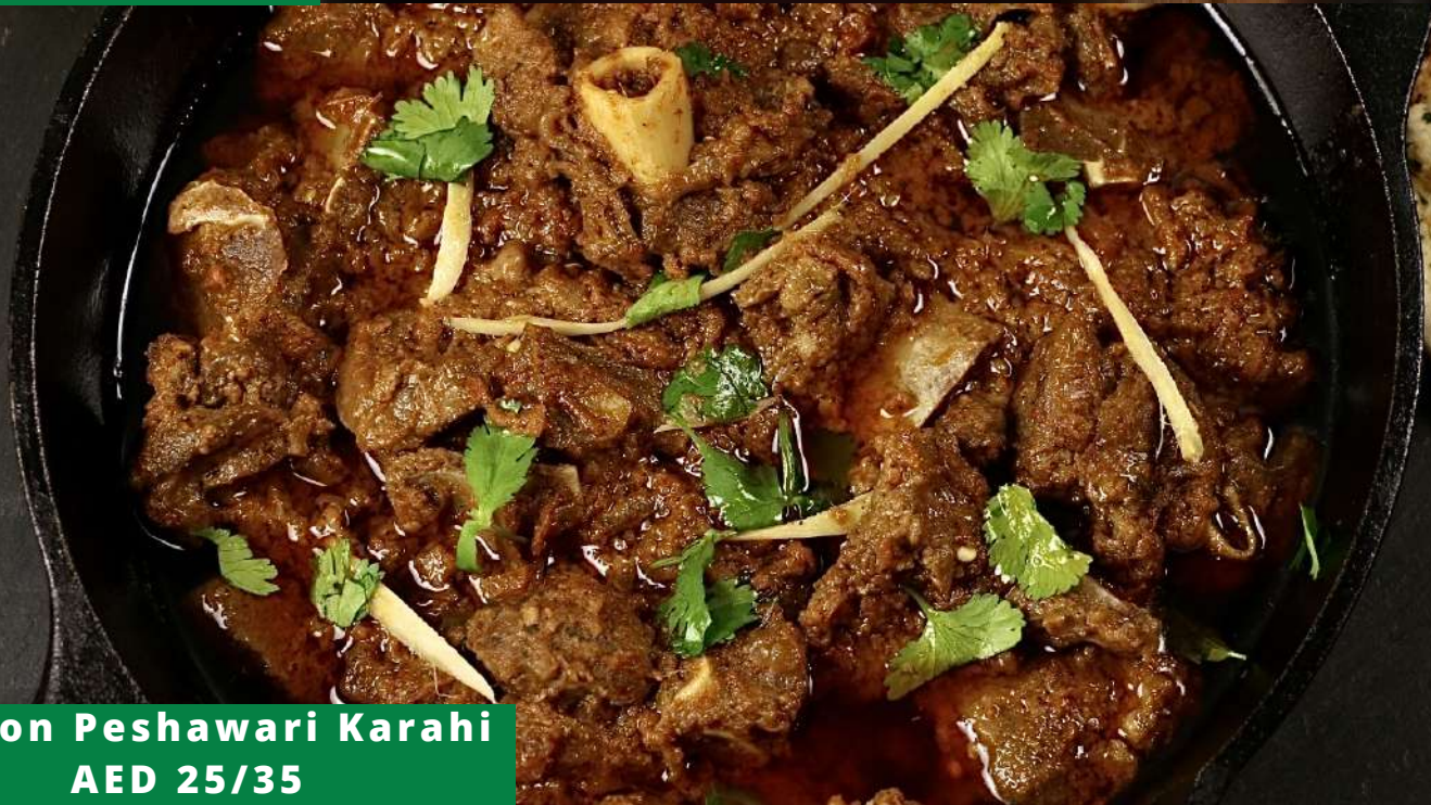
Mutton Peshawari Karahi AED 25/35