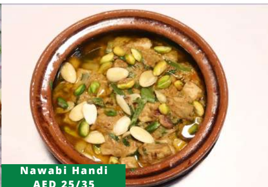
Nawabi Handi AED 25/35