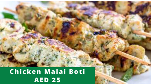
Chicken Malai Boti AED 25