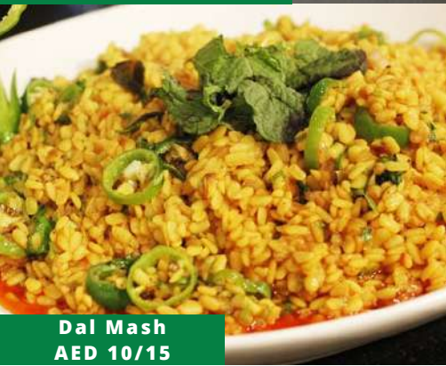
Dal Mash AED 10/15