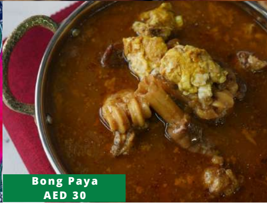
Bong Paya AED 30