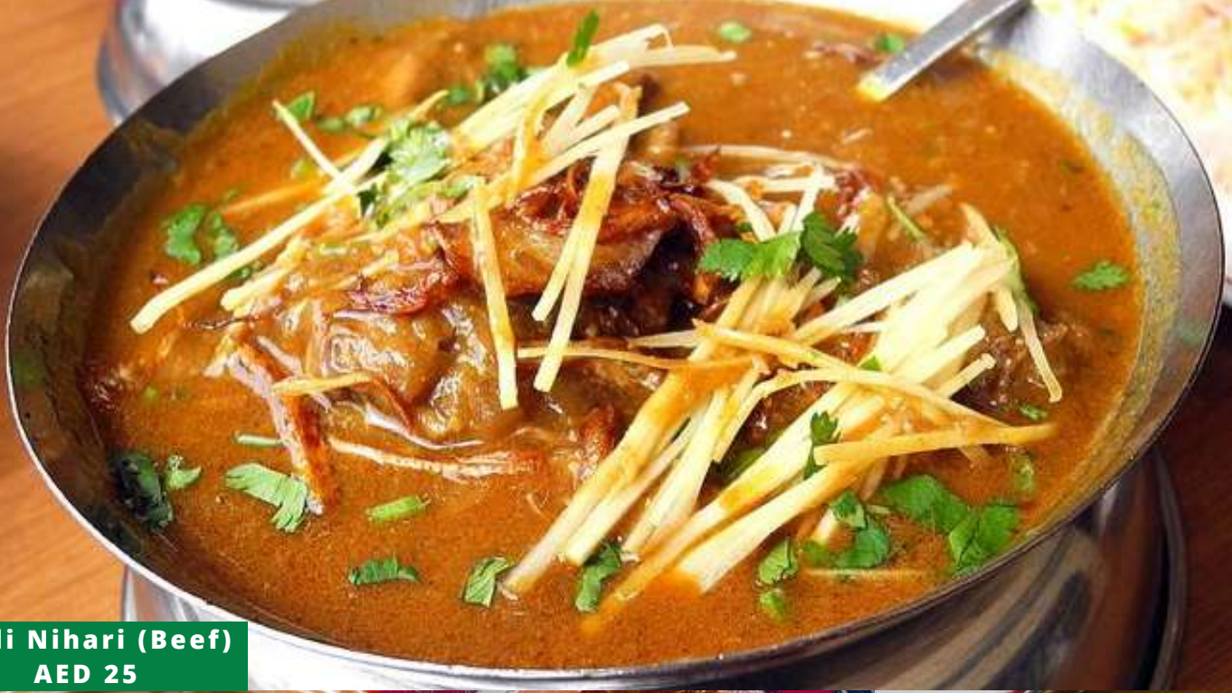
Nalli Nihari (Beef) AED 25