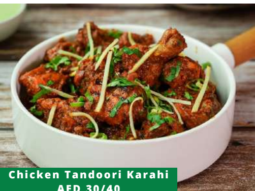
Chicken Tandoori Karahi AED 30/40