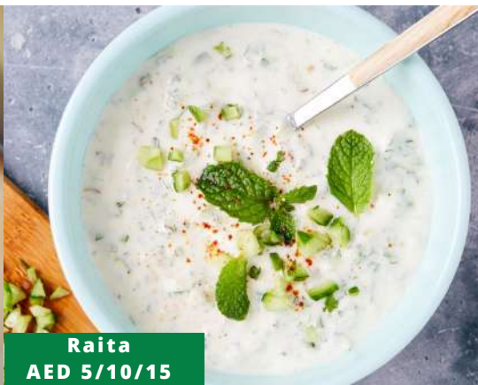
Raita AED 5/10/15