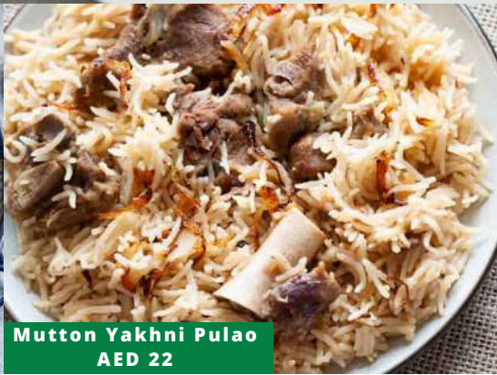
Mutton Yakhni Pulao AED 22