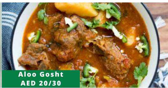
Aloo Gosht AED 20/30