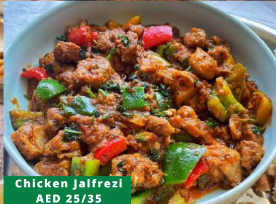
Chicken Jalfrezi AED 25/35