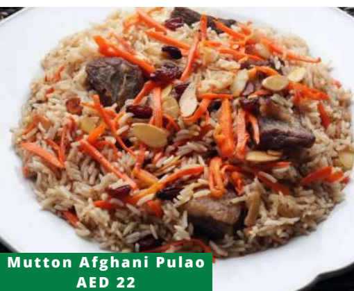
Mutton Afghani Pulao AED 22