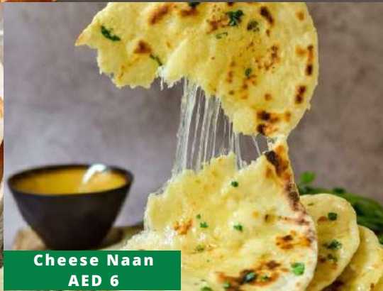
Cheese Naan AED 6