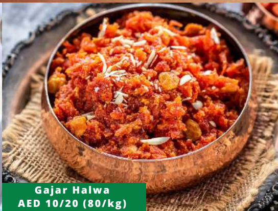
Gajar Halwa AED 10/20 (80/kg)