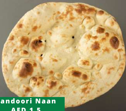
Tandoori Naan AED 1.5