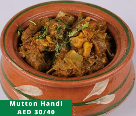
Mutton Handi AED 30/40