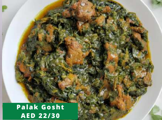
Palak Gosht AED 22/30