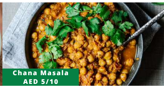
Chana Masala AED 5/10