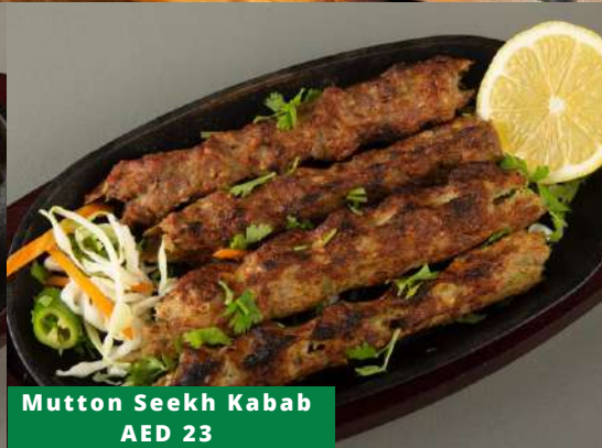
Mutton Seekh Kabab AED 23