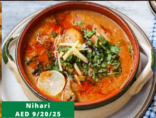
Nihari AED 9/20/25