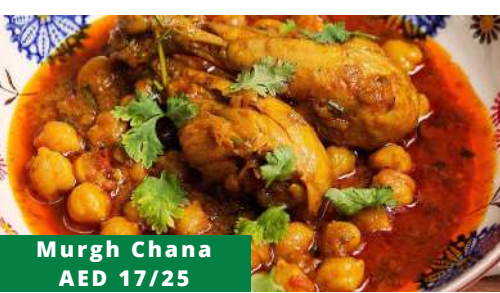
Murgh Chana AED 17/25