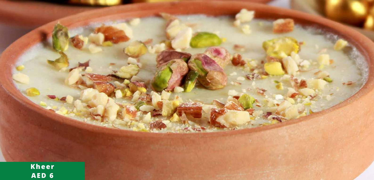
Kheer AED 6