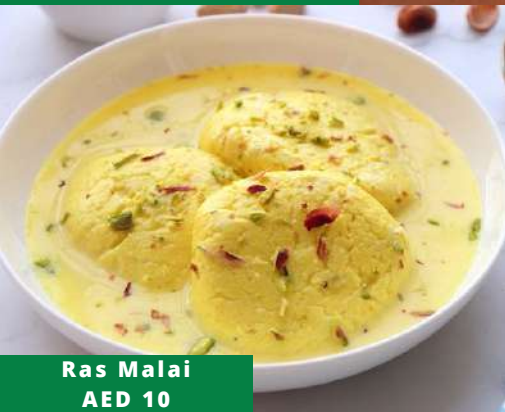
Ras Malai AED 10