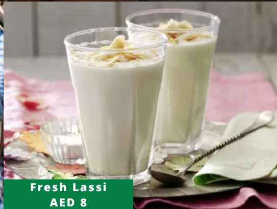
Fresh Lassi AED 8