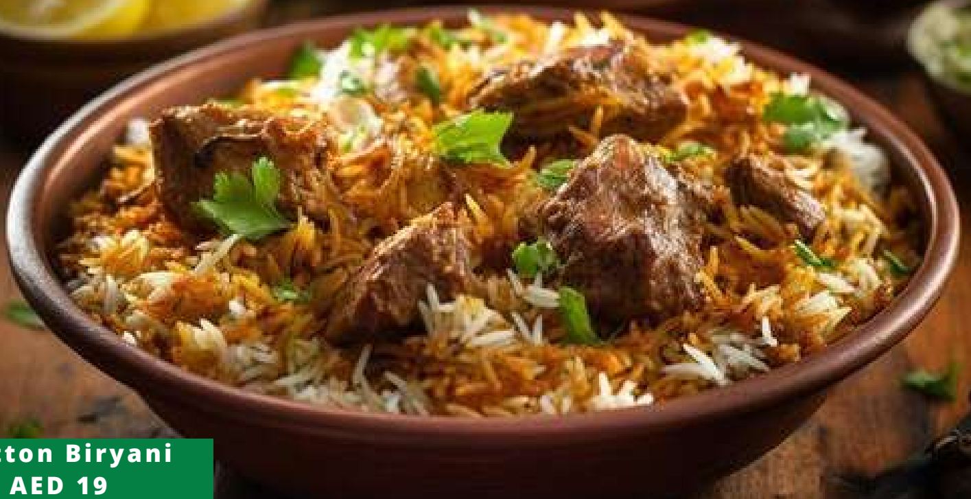
Mutton Biryani AED 19