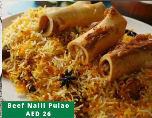
Beef Nalli Pulao AED 26