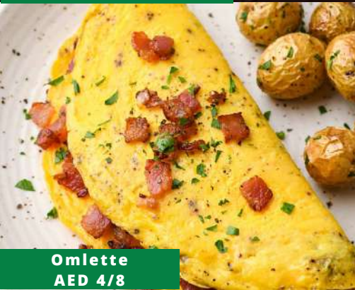
Omlette AED 4/8