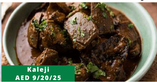
Kaleji AED 9/20/25