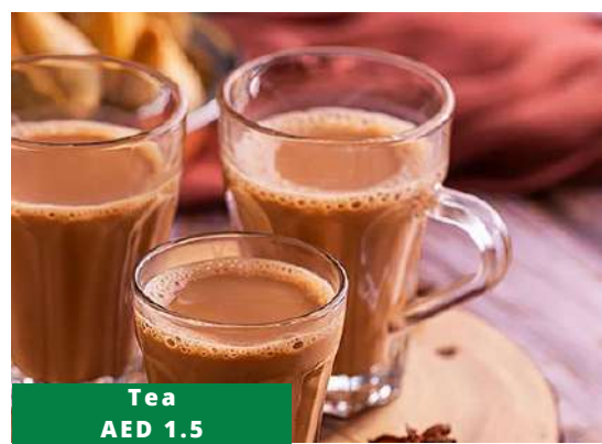
Tea AED 1.5