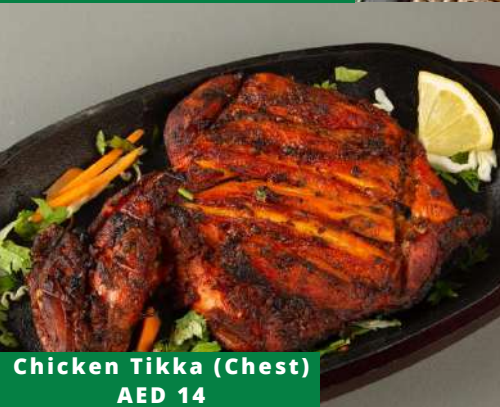
Chicken Tikka (Chest) AED 14