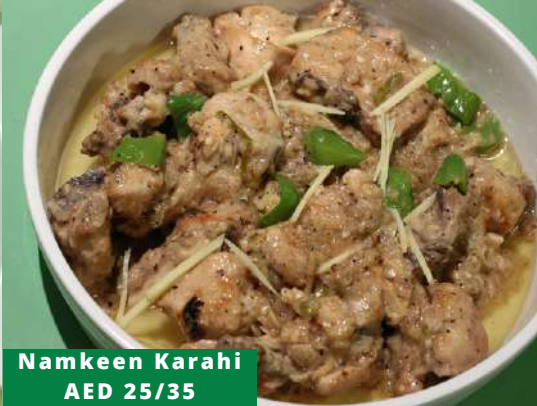
Namkeen Karahi AED 25/35