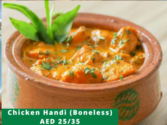
Chicken Handi (Boneless) AED 25/35