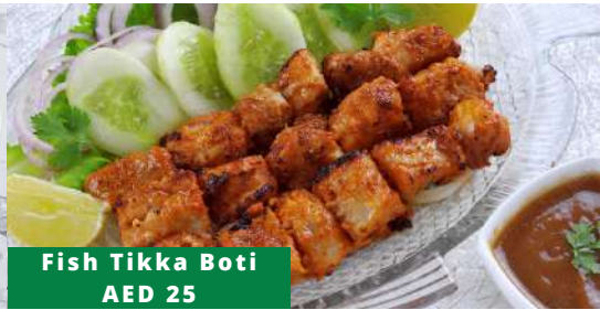
Fish Tikka Boti AED 25