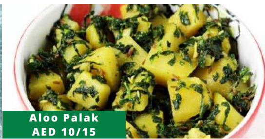
Aloo Palak AED 10/15