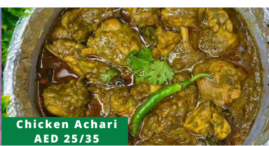
Chicken Achari AED 25/35