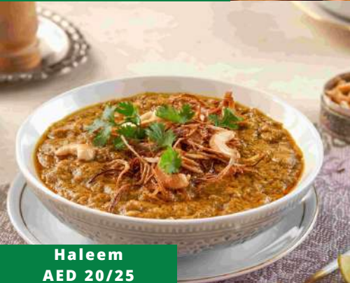
Haleem AED 20/25