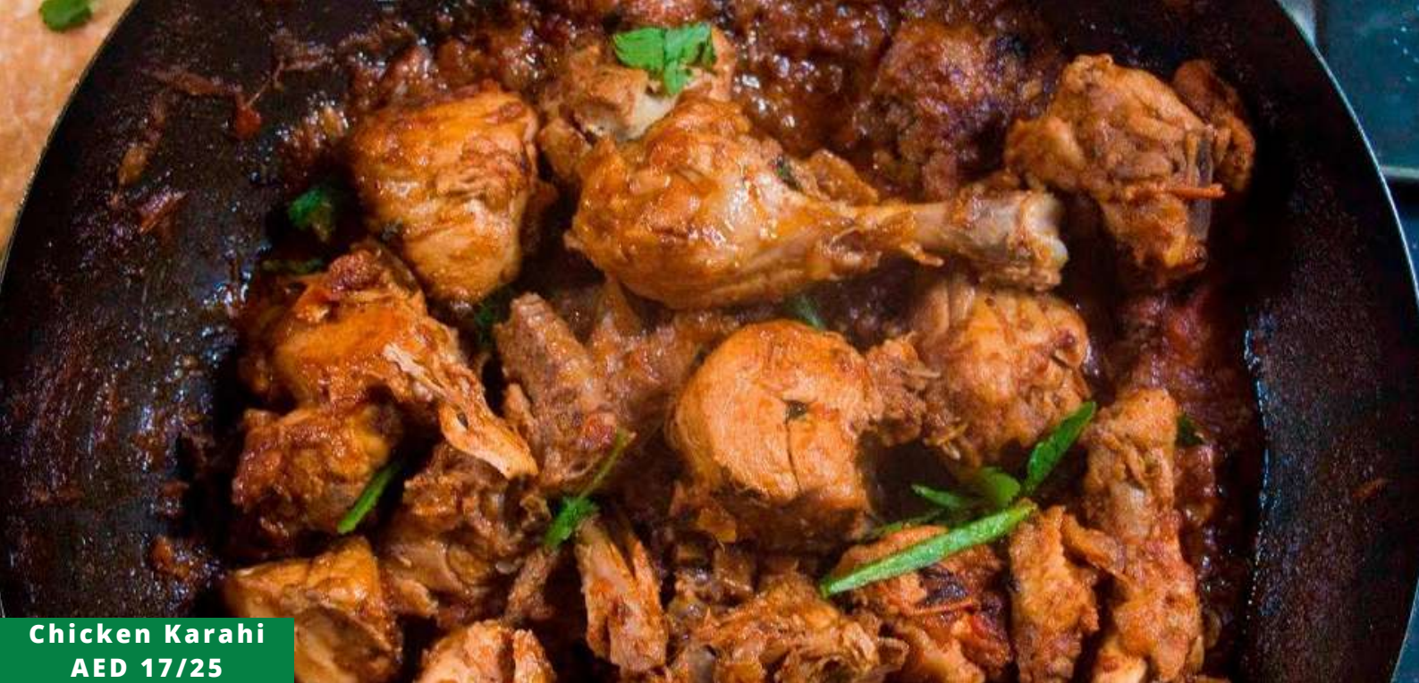
Chicken Karahi AED 17/25