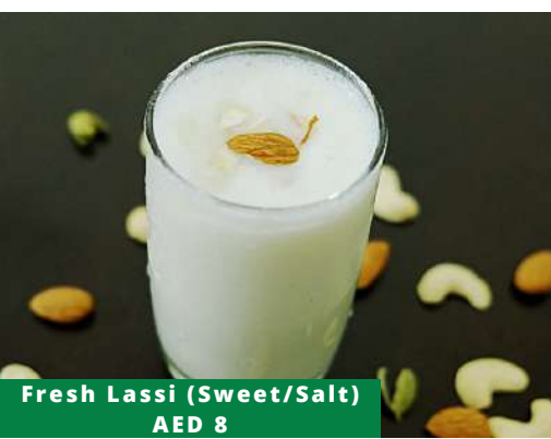
Fresh Lassi (Sweet/Salt) AED 8