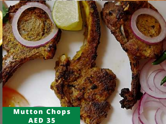
Mutton Chops AED 35