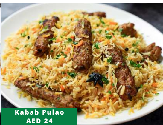
Kabab Pulao AED 24