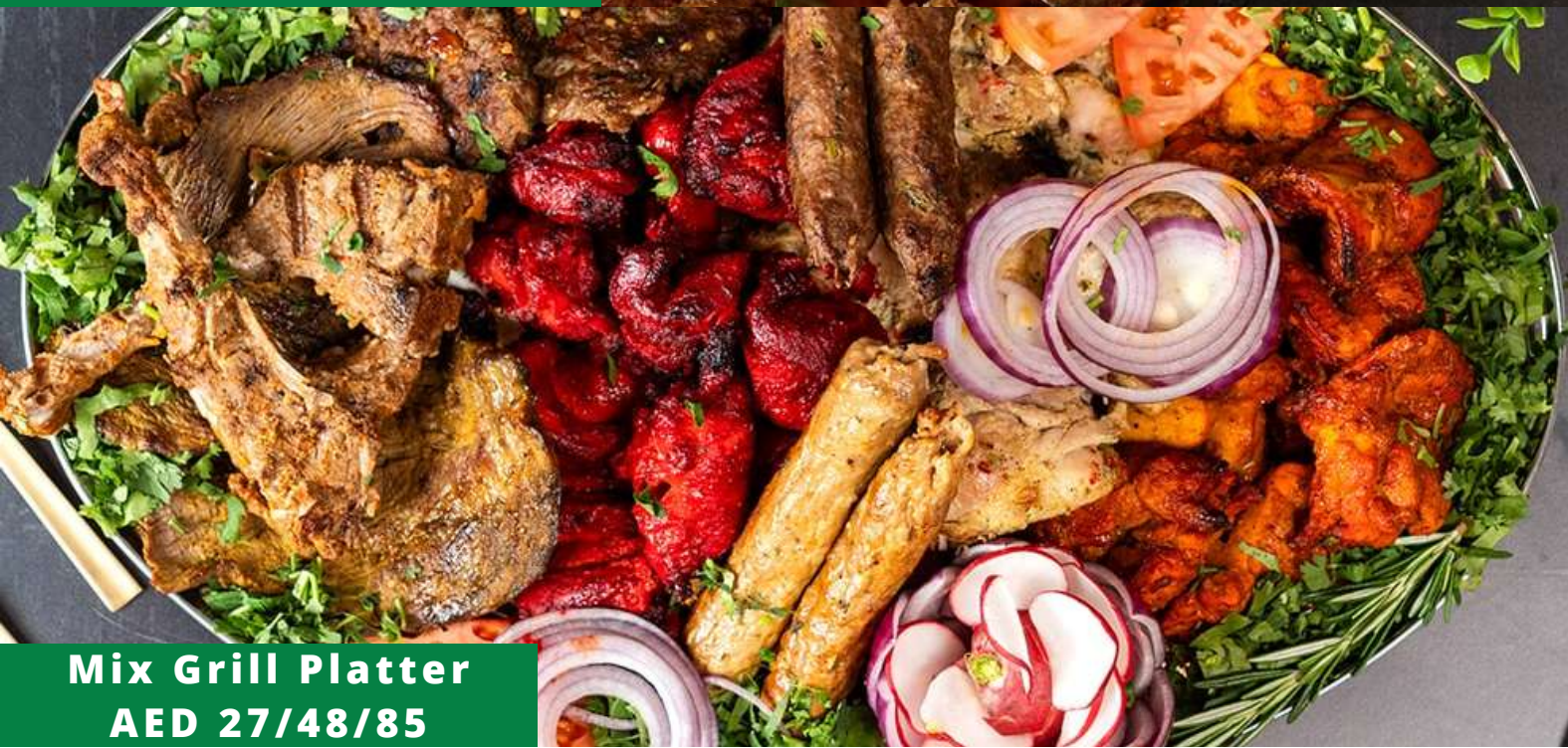
Mix Grill Platter AED 27/48/85