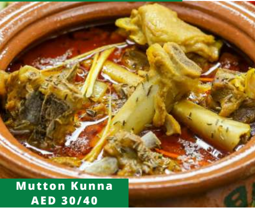
Mutton Kunna AED 30/40