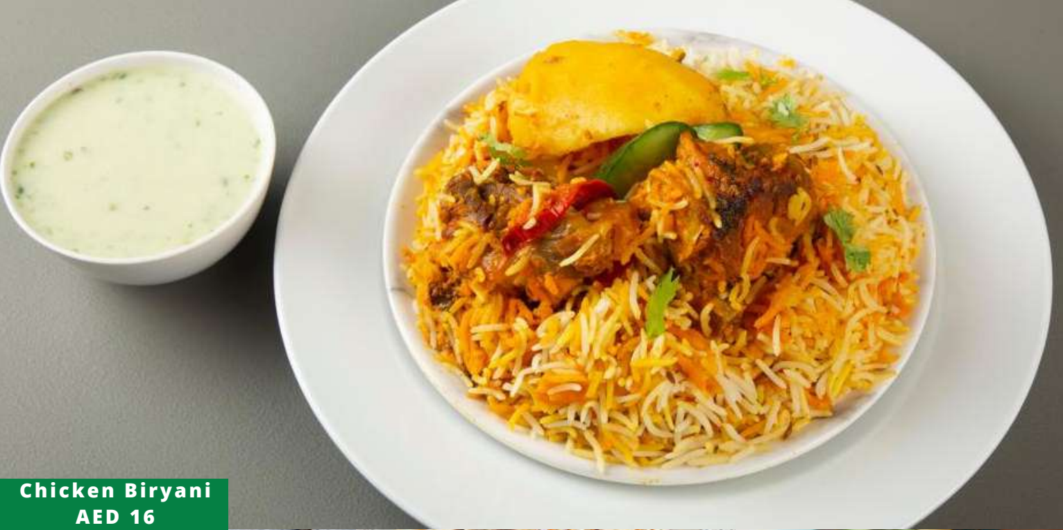
Chicken Biryani AED 16