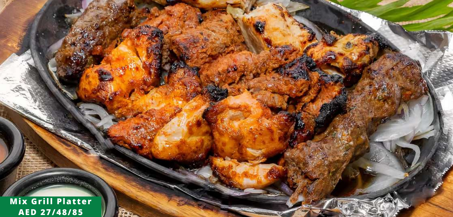
Mix Grill Platter AED 27/48/85