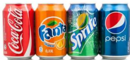
Soft Drink AED 3